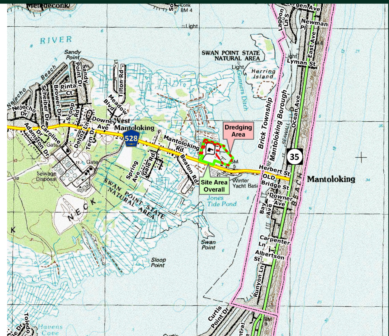
USGS QUADRANGLE- POINT PLEASANT 2016 SCALE: 1"=2000'