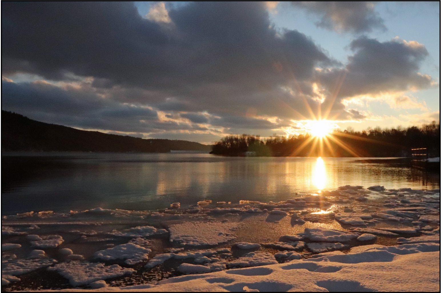
Winner Overall, Sunset Over A Frozen Lake, Beltzville Dam & Reservoir, Photo by Stacey Hines

In 2021, the U.S. Army Corps of Engineers Philadelphia District ran a social media based photo contest for the public. Participants were encouraged to submit their best photos of the District's 5 dams in Eastern Pennsylvania: Blue Marsh Lake, Beltzville Dam, Francis E. Water Dam, Prompton Dam, General Edgar Jadwin Dam and adjacent state park areas. Participants from across the region submitted photos. Then, the District invited the public to vote for their favorite photographs from each season.