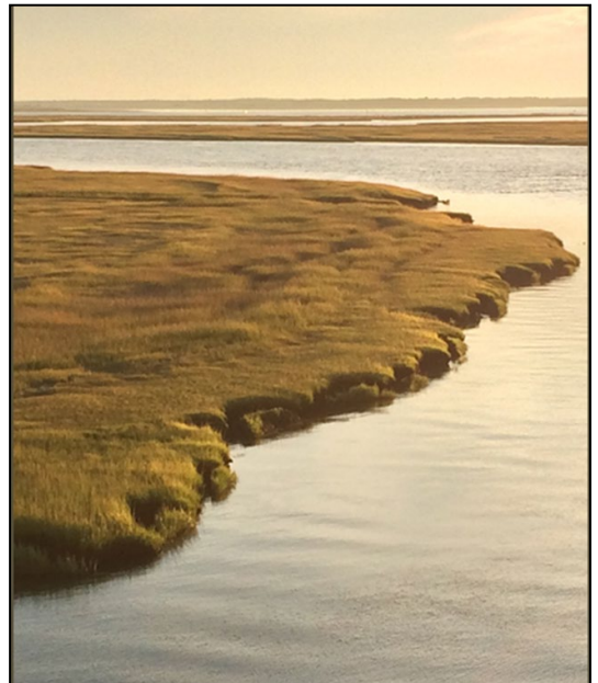
Below: New sediment management techniques like strategic placement along degraded marshes near the NJIWW channel are being considered