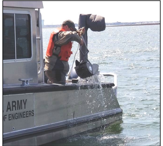
Above: USACE researcher takes a sediment sample from the NJ Intracoastal Waterway Channel

USACE and TWI will be leading field data collection. USACE began collecting sediment and hydrodynamic data in fall 2019. System hydrodynamics, sediment properties and mobility will be utilized for project selection, design and modeling sediment placement effectiveness here and elsewhere. TWI has been collecting avian site usage data at a potential placement site. Data will be used to inform baseline conditions and initial designs, develop placement strategies that strive to mimic natural processes, coordinate with resource agencies, and construct several placements by early 2021. Monitoring data will be collected throughout all activities. We will evaluate adaptive management strategies and inform policy to benefit long-term sustainable practices and coastal resilience in the region. The USACE, State of New Jersey and The Wetland Institute, as the lead partners in the SMILL, will coordinate frequently and inform the larger Working Group of progress, results and future plans. Updates on SMILL activities will also be shared periodically on USACE and partner websites.