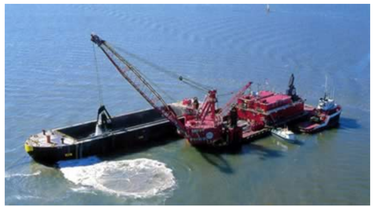
Figure 4. Clamshell Dredge

6.0 Existing Environment (Delaware River Main Channel Deepening Project Area)