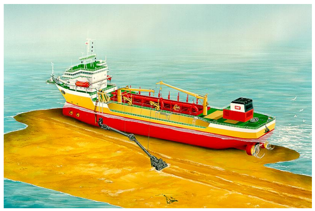
Figure 1. Hopper Dredge

Due to coastal conditions and the distance of the Delaware River Federal channel to the dredged material placement sites, it is unlikely that hydraulic cutter suction dredges with direct pump (pipeline) to the placement sites will be used to deepen Reach E; however, cutter suction dredges could be used in conjunction with a spider barge to load hopper scows with dredged material. When full, the hopper scows are transported by tugboats to the placement site or pumpout location. Hopper scows could also be loaded directly using mechanical dredges (see Section 5).