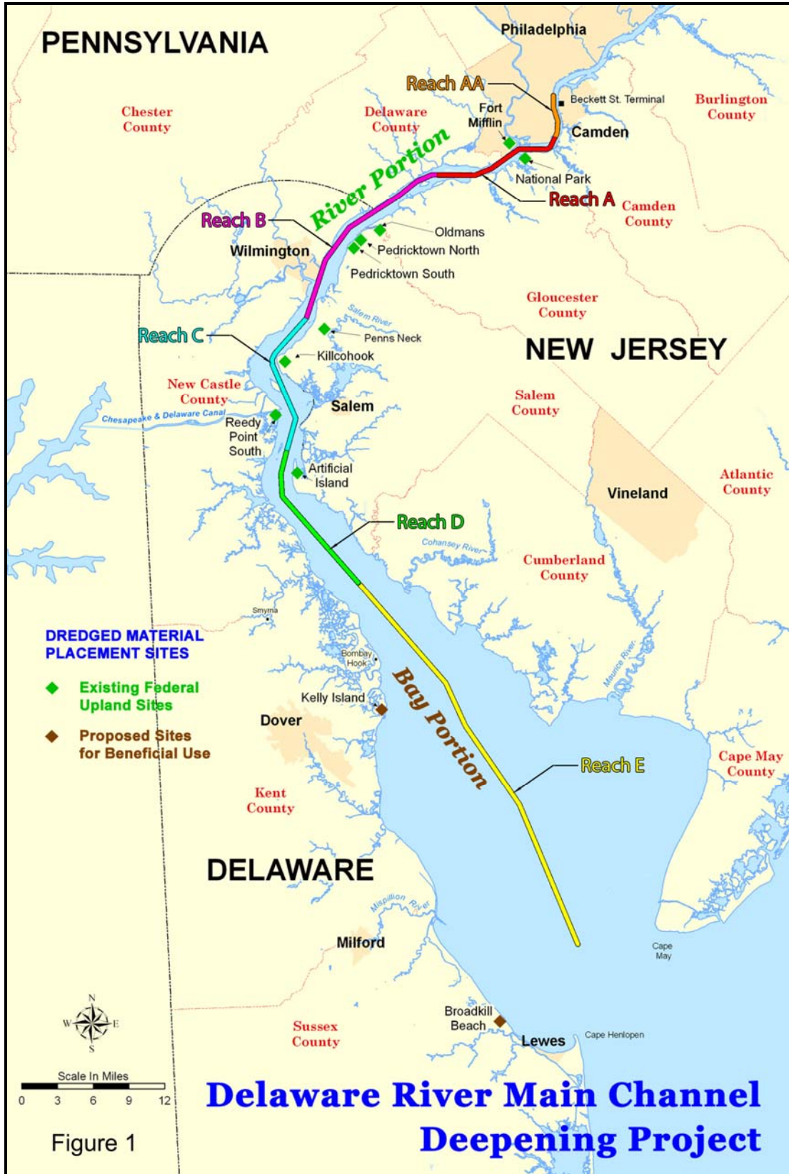
Figure 1 Project Location Map