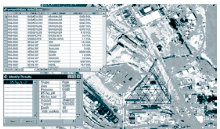
Screen shot of GIS database system showing field data, an aerial photo and a sampling grid.

You may be wondering what the Army Corps of Engineers (the Corps) has been up to at DuPont Chambers Works. Since the first project newsletter in September 1999, the Corps has been working on a site history investigation, a Geographic Information System (GIS) database, and establishing work plans for upcoming field sampling at the plant.