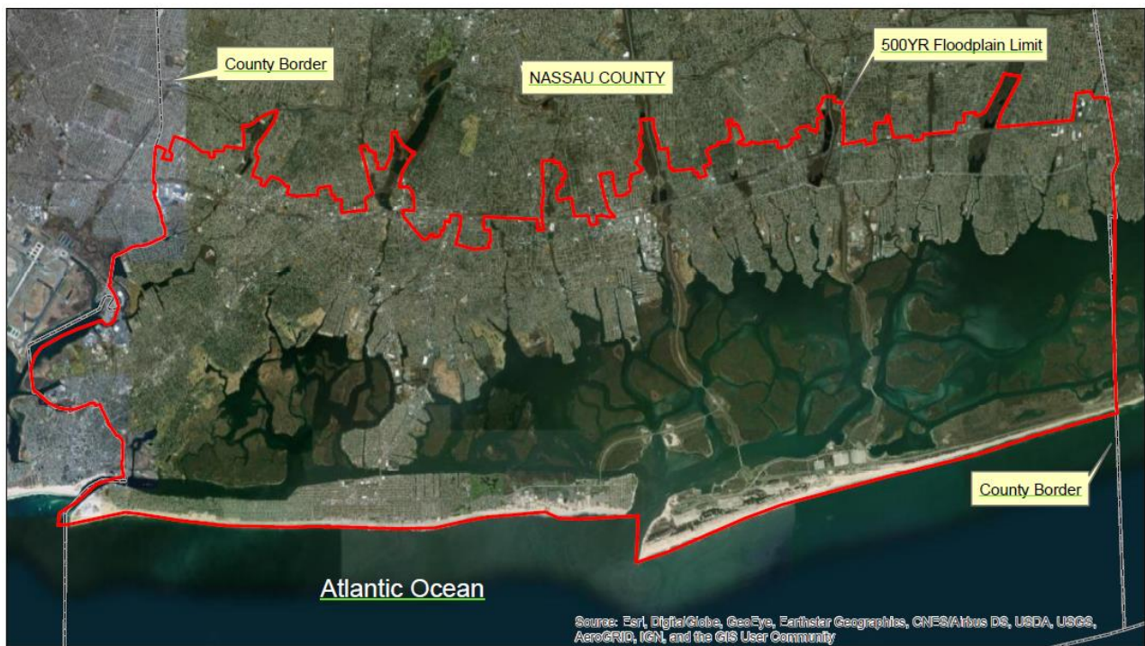
Figure 1.1.1. NCBB Project Study Area.

The objective of the feasibility study is to investigate and recommend implementable solutions to address the affected areas caused by Hurricane Sandy within the boundaries of the Nassau County Back Bays (NCBB). Several alternative plans were considered and identified within the study. Such alternatives consist of both structural and non-structural design alternatives. The Tentative Selected Plan (TSP) includes non-structural components within the NCBB region. Due to the lack of geotechnical data available in the feasibility phase to perform geotechnical analyses, this report will focus on the geological conditions in the highly vulnerable areas (HVAs) within Nassau County Back Bay. The project area is shown in Figure 1.1.1.