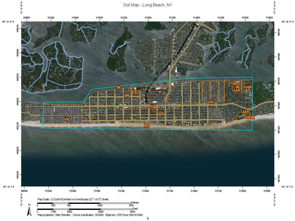
Figure 5.1.4. Long Beach Soil Map