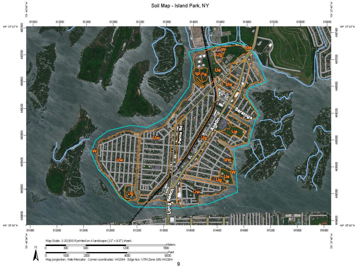
Figure 4.1.3. Village of Island Park Soils Map