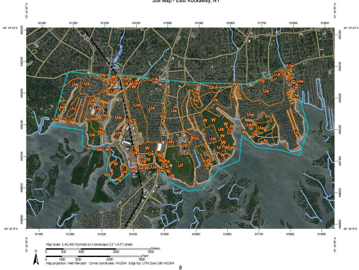
Figure 3.1.2. Village of East Rockaway Soils Map