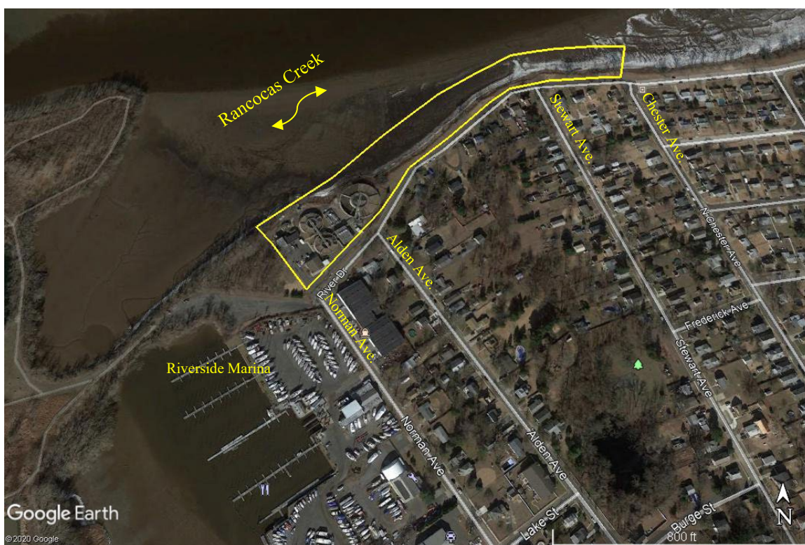
Figure 3: Location of the Study Area within the Township of Delran, New Jersey.