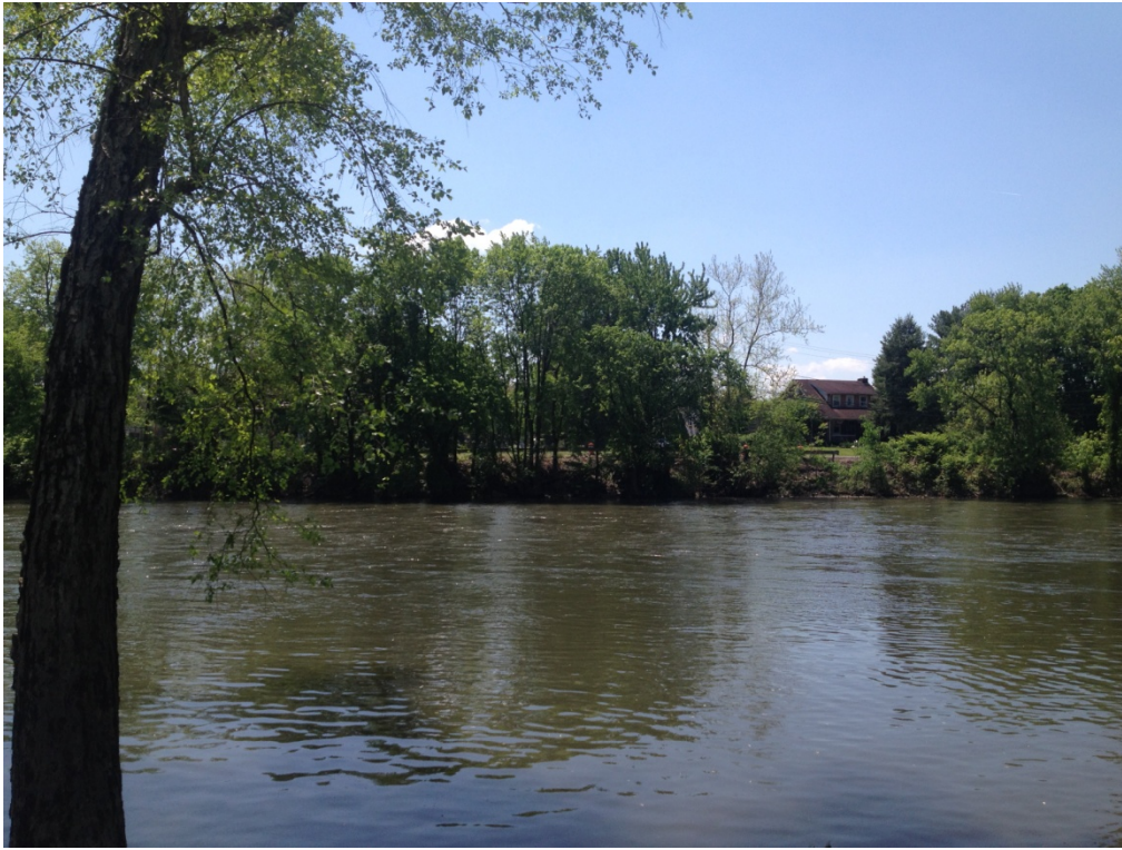
Figure 3. View of project area from the opposite streambank (Photo - May 2014).