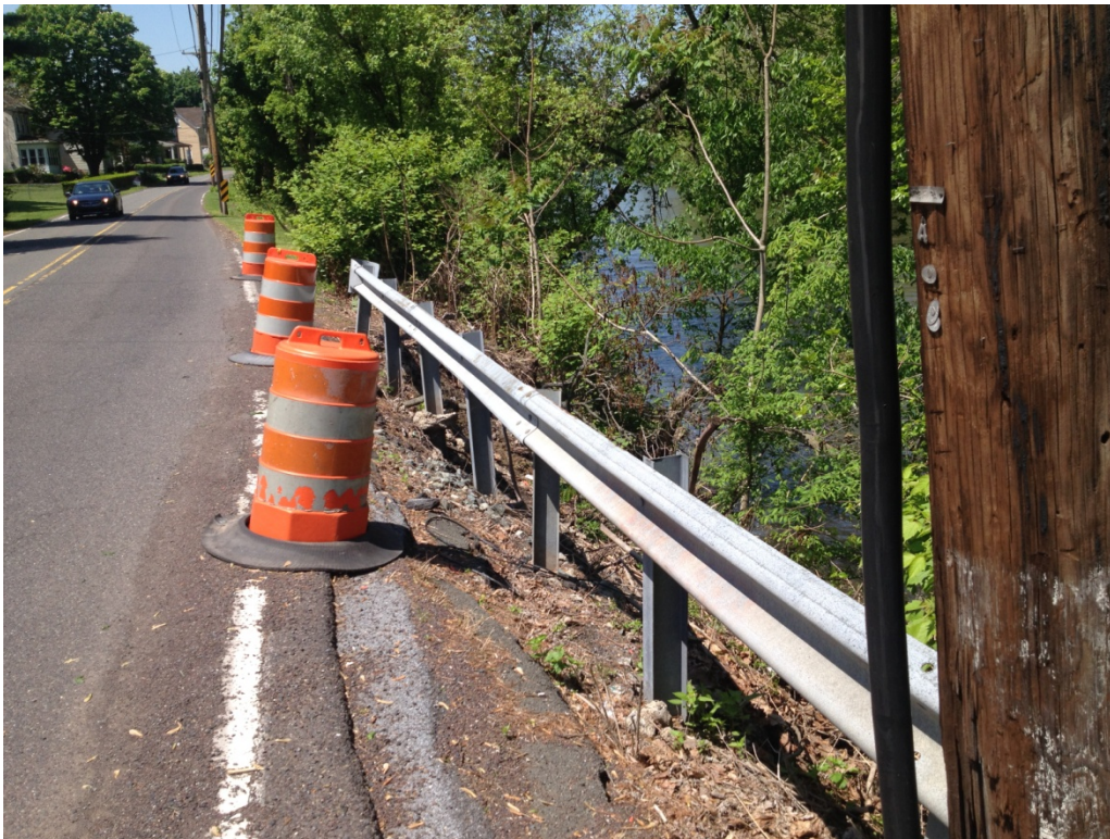
Figure 4. View of project area with the failing streambank (Photo – May 2014).