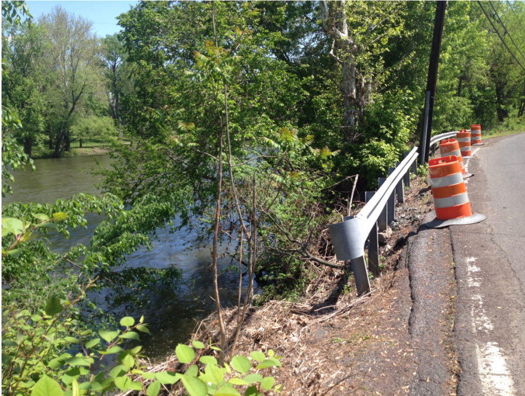
Figure 5. Another view of project area with failing streambank and infrastructure (Photo – May 2014).