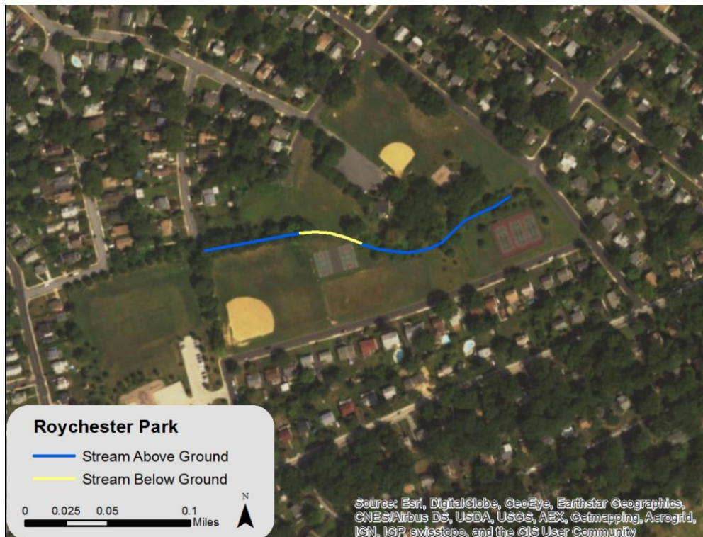
Figure 2: Map of Roychester Park showing location of Sandy Run Creek