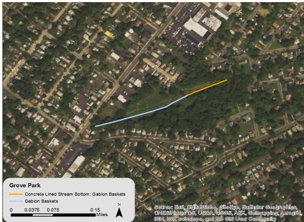
Figure 3: Map of Grove Park showing location of Sandy Run Creek