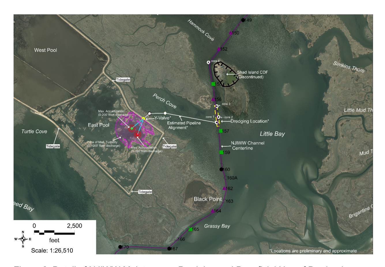
Figure 2. Detail of NJIWW Maintenance Dredging and Beneficial Use of Dredged Material Placement in East Pool impoundment of Edwin B. Forsythe National Wildlife Refuge.