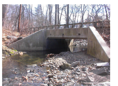
9. Small fish (up to 6") frequent the pool under the Rock Lane Bridge. The channel is more stable and naturalized due to the vegetated stream banks. Action/BMP: No action necessary: continue to maintain the land uses surrounding this area.

8. For the next half mile from Washington Lane to the Rock Lane bridge, the stream flows through a wooded valley with the lightly traveled Rock Lane close on its southern bank. Action/BMP: No action necessary: continue to maintain the land uses surrounding this area.