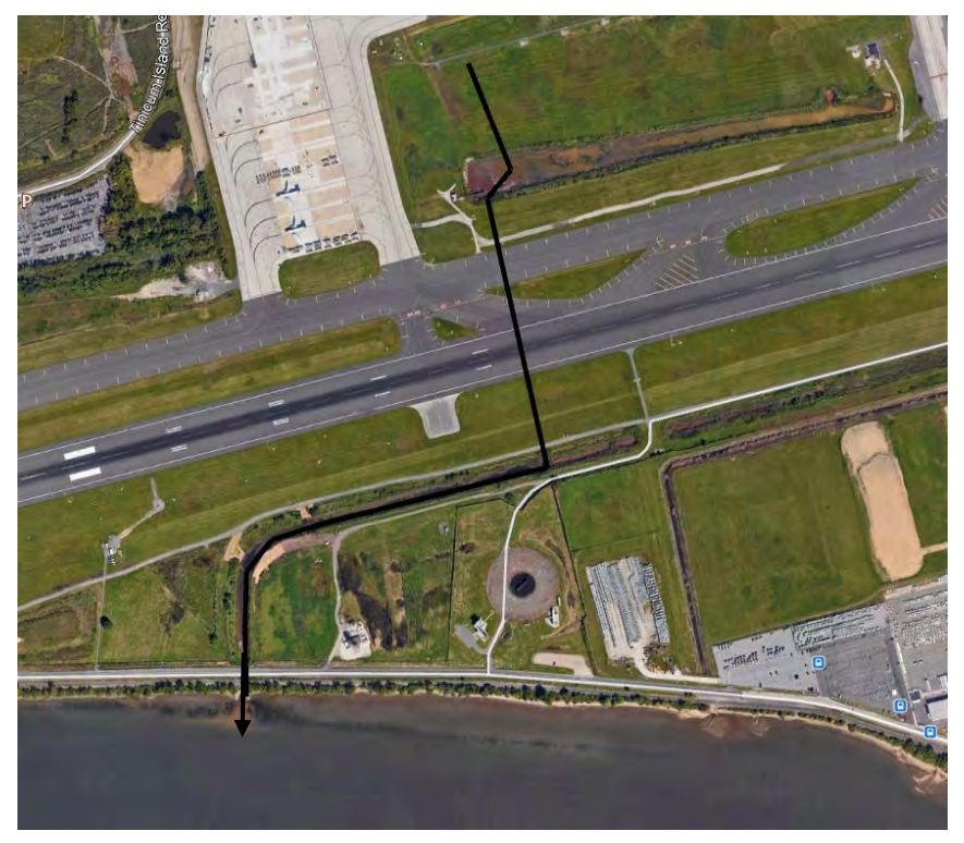
Figure 2. Flow path from Subject Wetlands to the Delaware River

(ii) Nutrient recycling: Nutrient recycling likely occurs within the Subject Wetlands, particularly nitrogen. However, sequestration is limited due to the frequent mowing of the vegetation.