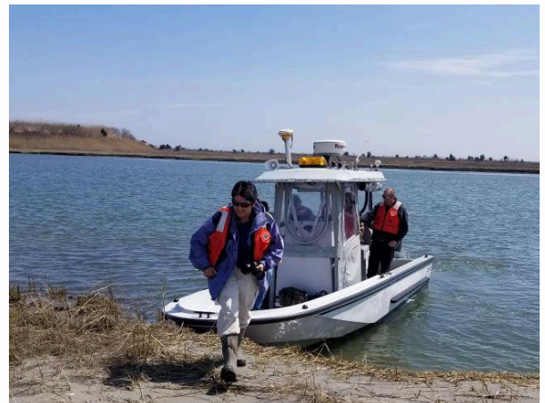
Below: SMIIL team visits an historic placement site to evaluate resulting marsh resilience