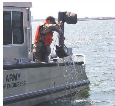
Above: USACE researcher takes a sediment sample from the NJ Intracoastal Waterway channel.

USACE and TWI will be leading field data collection. USACE began collecting sediment and hydrodynamic data in fall 2019. System hydrodynamics, sediment properties and mobility will be utilized for project selection and design and modeling sediment placement effectiveness here and elsewhere. TWI has been collecting avian site usage data at a potential placement site. Data will be used to inform baseline conditions and initial designs, develop placement strategies that strive to mimic natural processes, coordinate with resource agencies, and construct several placements by early 2021. Monitoring data will be collected throughout all activities. We will evaluate adaptive management strategies and inform policy to benefit long-term sustainable practices and coastal resilience in the region. The USACE, State of New Jersey and The Wetlands Institute, as the lead partners in the SMILL, will coordinate frequently and inform the larger Working Group of progress, results and future plans. Updates on SMILL activities will also be shared periodically on USACE and partner websites.